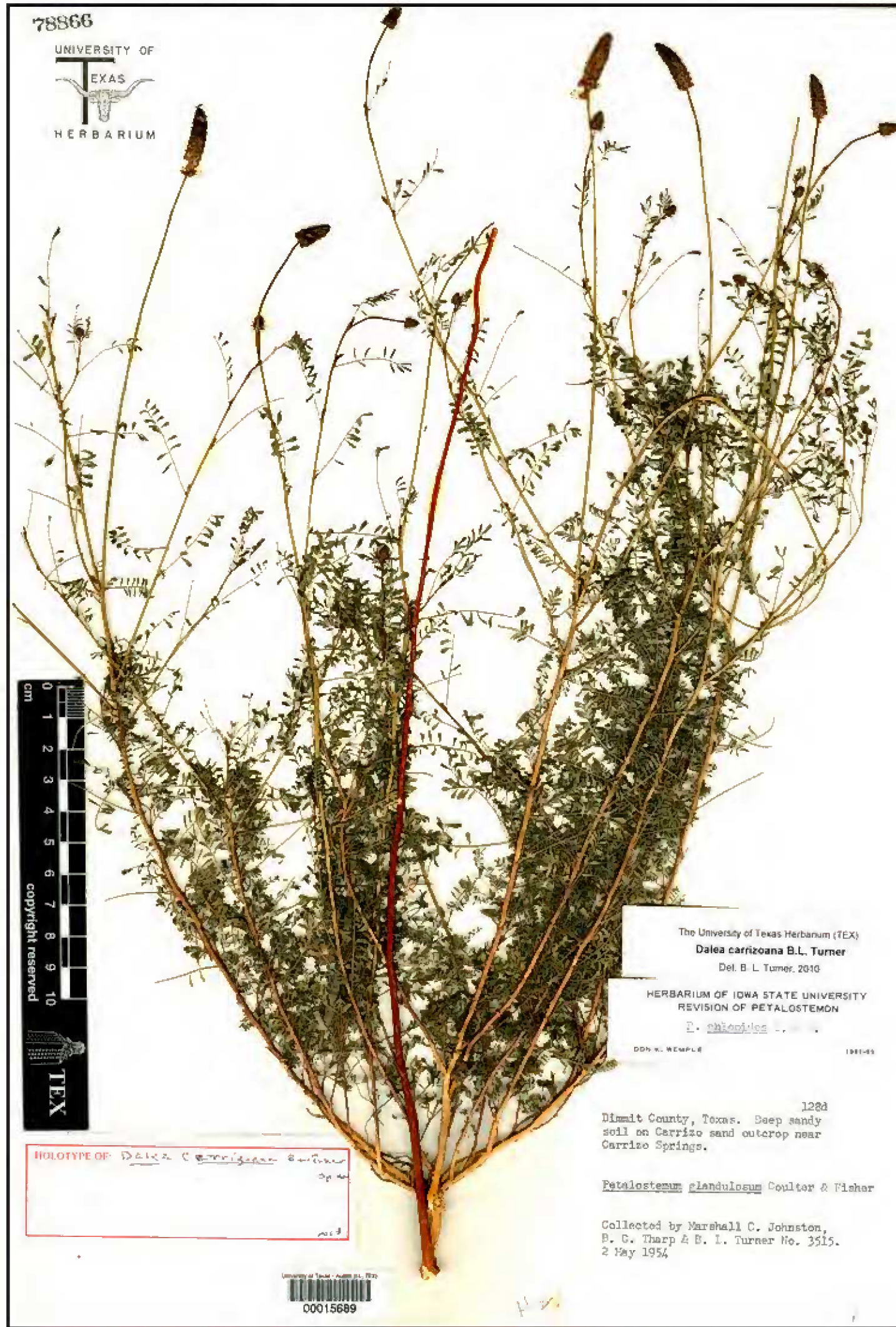
Fig. 1. Dalea carrizoana (holotype).